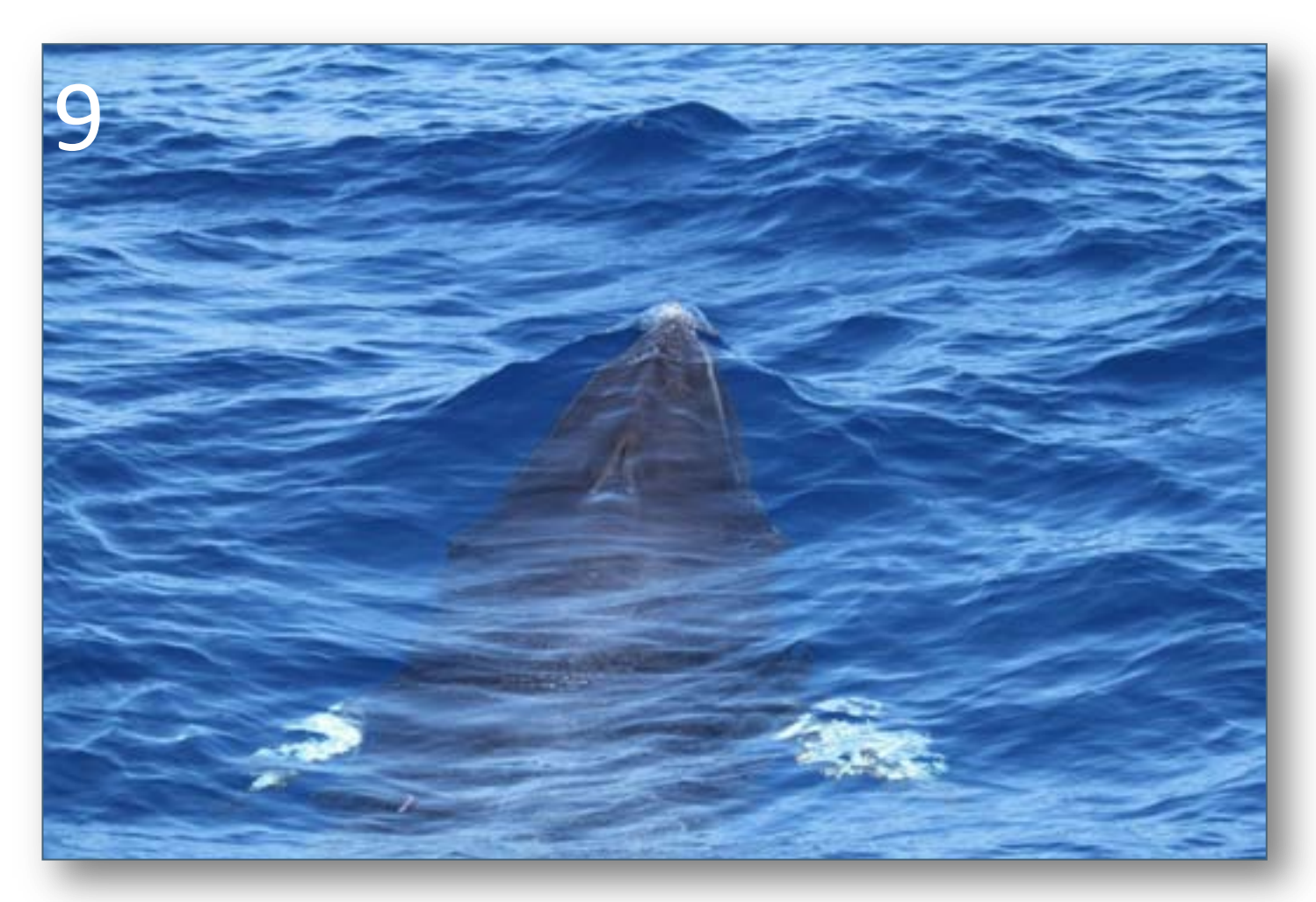
Figure 7-9 show 3 animals sighted in the area, B. brydei (7-8) and B. acutorostrata (9).